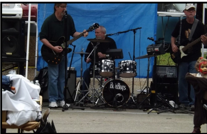
The Blue Beats provided an eclectic mix of blues, Motown and rock that kept the crowd dancing and singing.