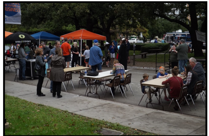
Hundreds of UTA faculty, students & friends tasted original chili recipes and enjoyed Steel City Pops, Ruth's Rolling Café, & Maui Wowi.