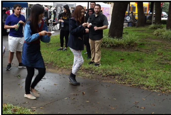
PSK won the Egg Spoon Relay and there was a 3-way tie between Weaver, KPMG & PSK for the Hula Hoop competition. In addition children enjoyed a bounce house.