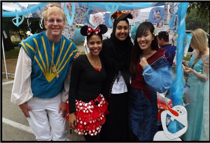
Darth Vader, Chewbacca, and Stormtroopers were in attendance, as well as Disney characters and several other themes.