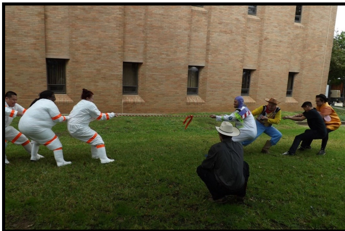
Tug Of War was competitive between the moonwalkers and Toy Story characters.