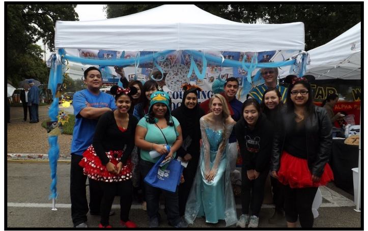
In costume, Accounting Society joined efforts to make the 31st Annual Chili Cook Off an outstanding event.