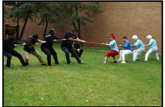
Beta Alpha Psi won the competition, but it was not easy, as they were up against Smurfs, spies, Disney characters, cowboys, & more.